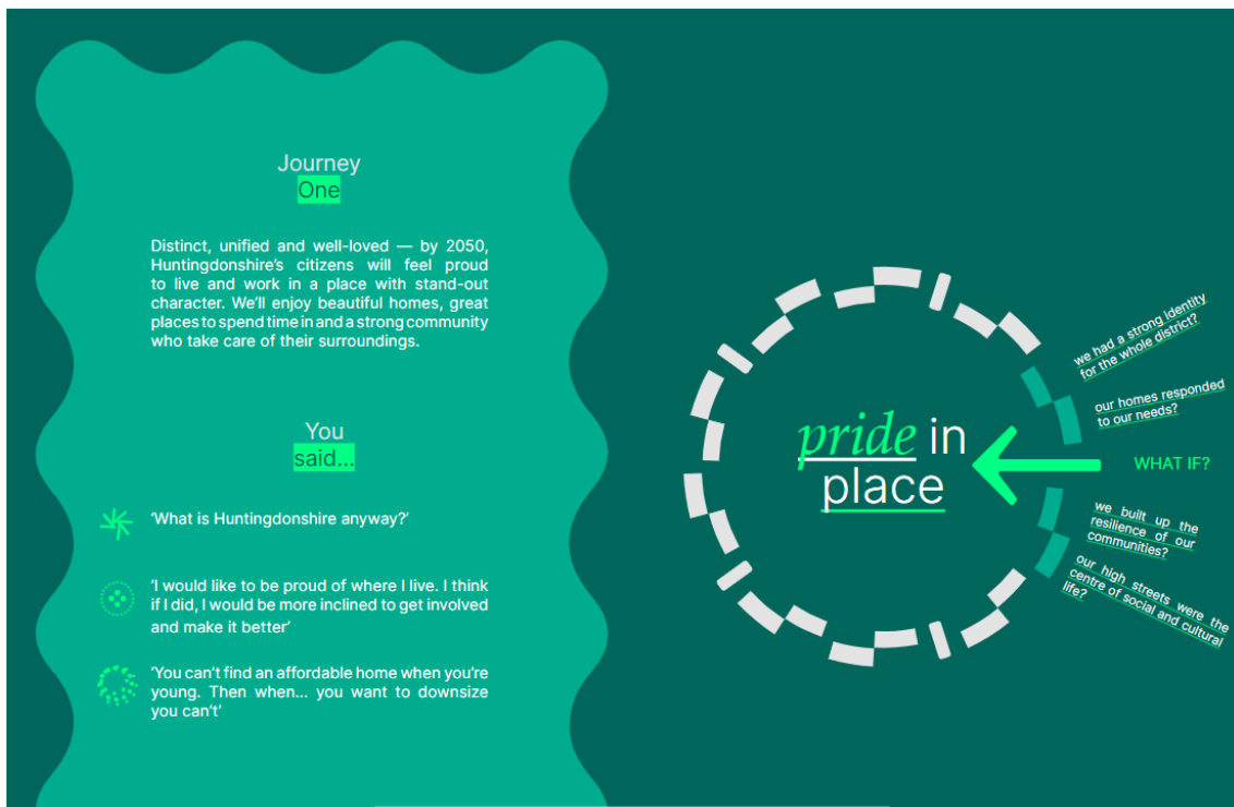
Diagram 3: Journey and Pathway example